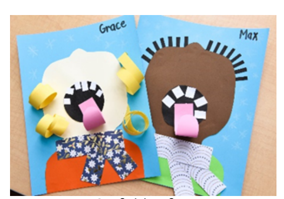
Craft idea from: https://lyndseykuster.com/

Cut circles for the mouth and allow the kids to create their own tongues.